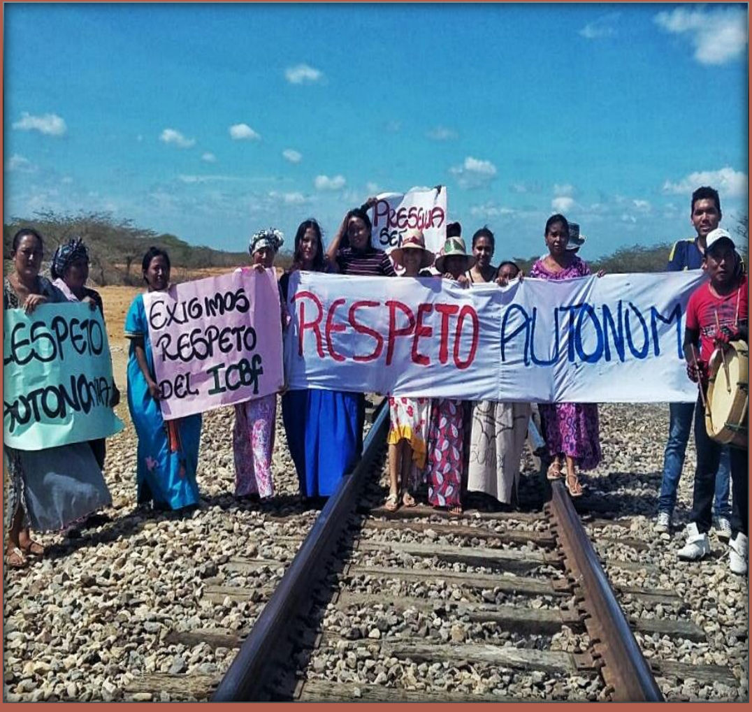
Mountaintop Removal Mining: El Cerrejon Mine and the Wayúu People