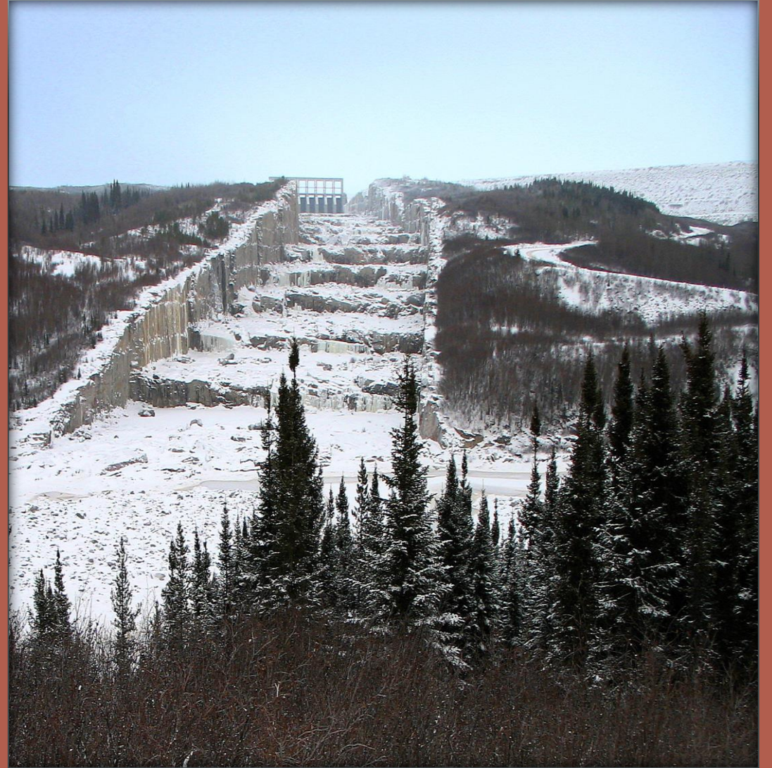
Damming: James Bay Project and the Northern Cree