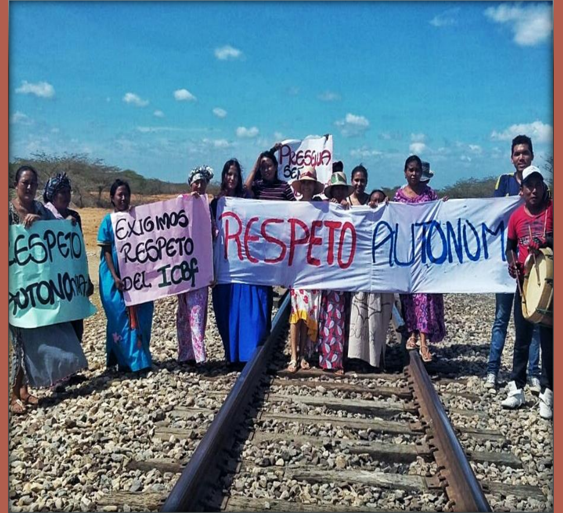
Mountaintop Removal Mining: El Cerrejon Mine and the Wayúu People