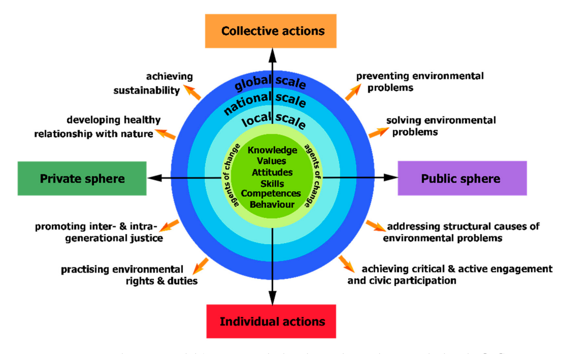
Figure 2. The EEC model (source: Hadjichambis and Paraskeva-Hadjichambi, [14]).

spheres (private and public) and at different scales (local, national and global). The constitutional elements of the EEC (outputs, actions' dimensions, spheres and scales) form the EEC model which is integrated and illustrated in Figure 2. It should be clarified that the exact position of each output in the EEC model does not illustrate its relationship with actions' dimensions, spheres and scales.